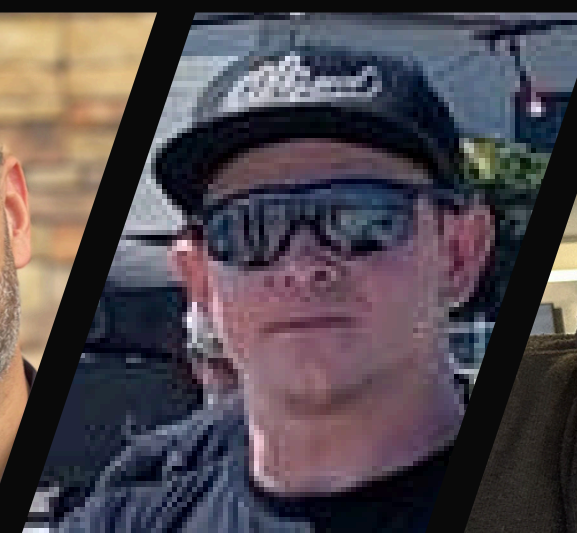
JOHN TEMPLE OPERATIONS